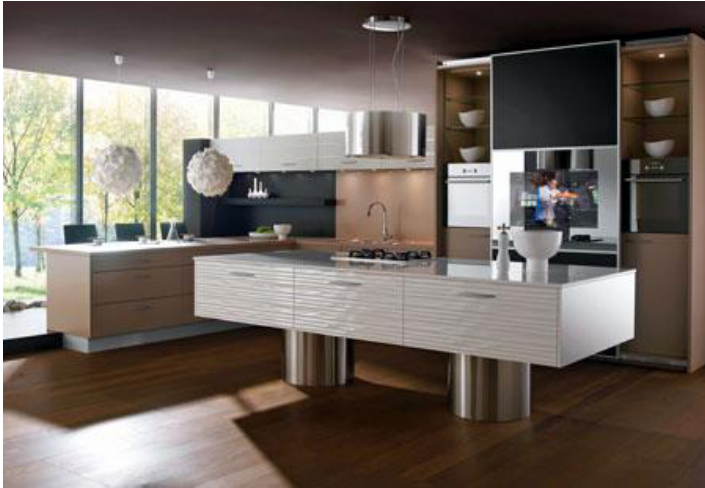
Product category: Residential | Kitchen | 32.0"