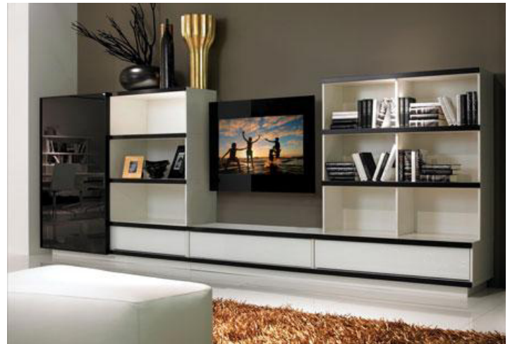
Product category: Residential | Living room | 32.0"