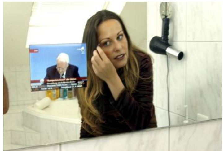
Product category: Residential | Bathroom | 13.3"