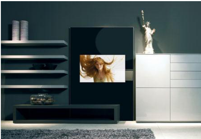
Product category: Residential | Living room | 46.0"