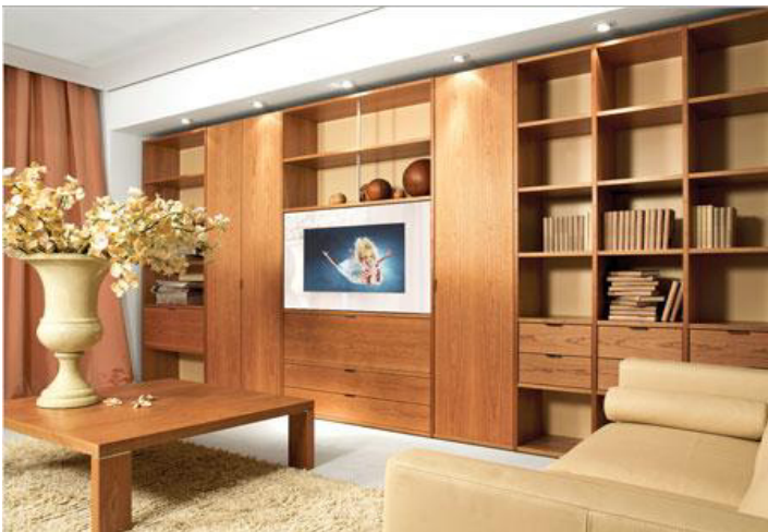
Product category: Residential | Living room | 46.0"