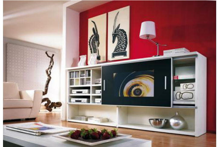
Product category: Residential | Furniture | 32.0"