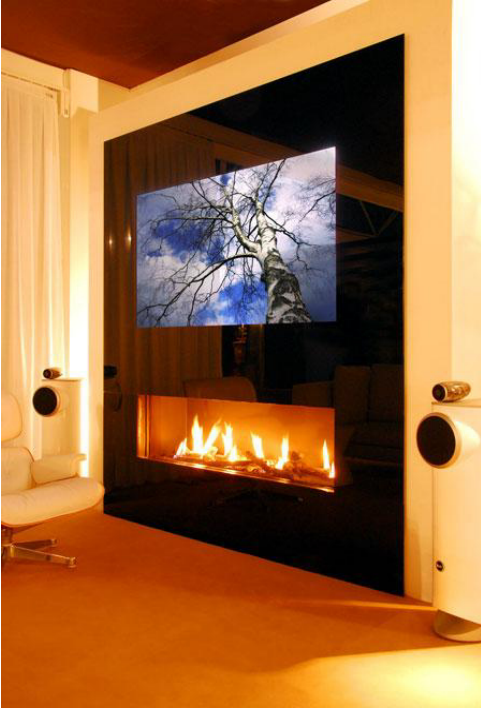
Product category: Residential | Fireplace | 46.0"